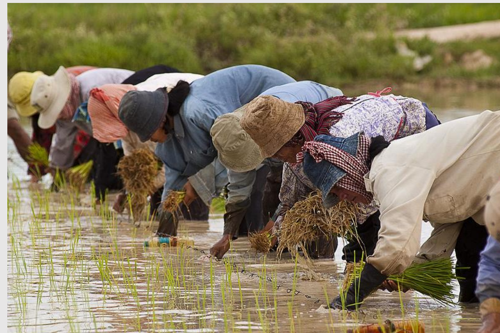
photo of Cambodian rice farmers

compiled by Topsy Page www.topsypage.com