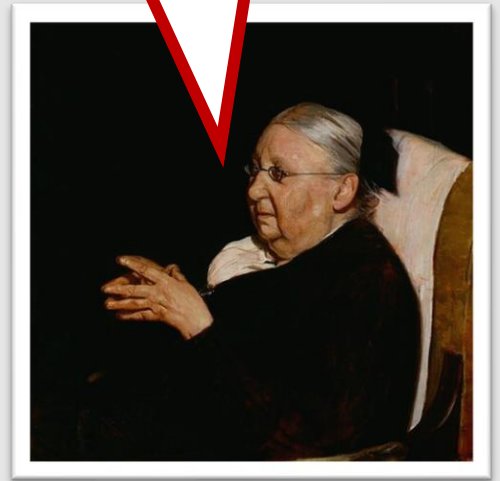
Gertrude Jekyll garden designer

The love of gardening is a seed once sown that never dies.