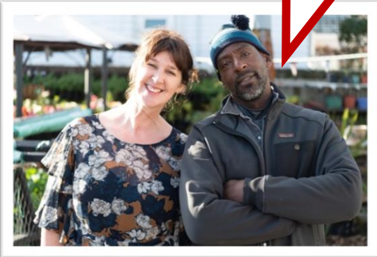
Ron Finley urban food-growing activist

Growing your own food is like printing your own money!