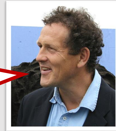
Monty Don TV gardener

I'm just as happy growing cabbages as the rarest plant in the world.